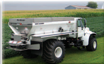
L4000G4 With MultiApplier