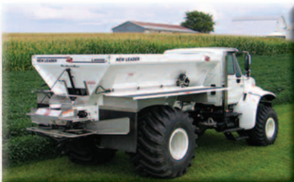
L4000G4 Single Hopper