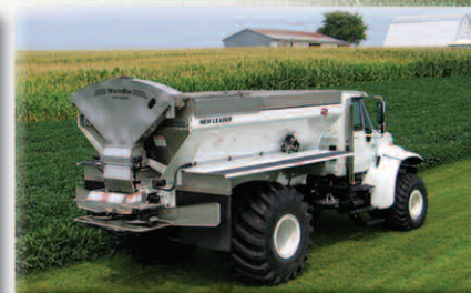
L4000G4 with MultiApplier and MicroBin