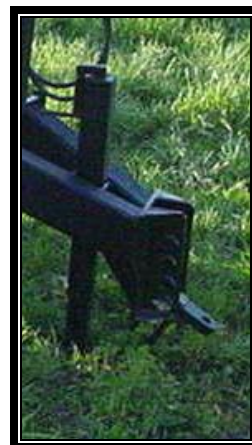
Adjustable dual clevis and 10000# drop foot jack. Front hose stand keeps hoses away from tractor hitch.