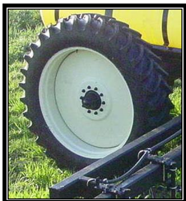
High clearance 46" lug tires with heavy 8-bolt hubs give you maximum crop clearance.