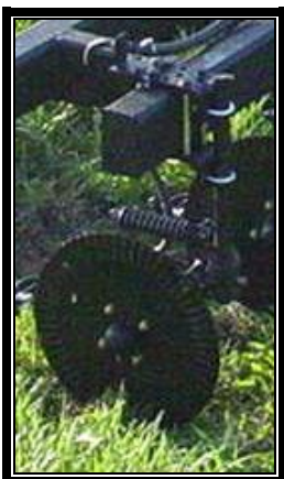
20" Coulters injection with straight stream nozzle and stainless steel nipple injects the fertilizer directly behind the coulters.