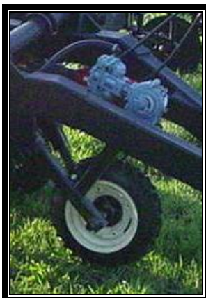
The spring- loaded ground driven pump is mounted on front bar for better visibility and auto- matically stops when toolbar is lifted for turnaround.