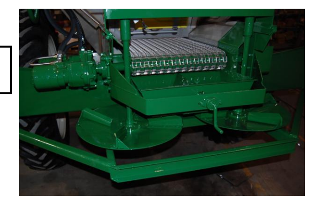
Spread Patterns: Fertilizer up to 80 - Lime up to 50'

High Pressure, Double Bearing spinner motors mounted overhead keeps motors out of fertilizer and other contaminants for longer life.