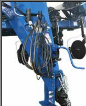
Hydraulic Hose Holders