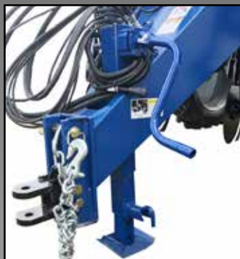
Gear Reduction Jack