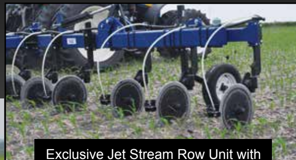
Exclusive Jet Stream Row Unit with high pressure direct injection or coulter knife injection