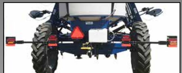
Lower Transport Light Bar Height