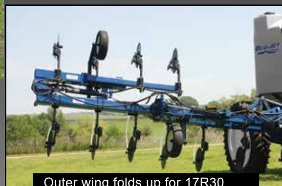
Outer wing folds up for 17R30 (76 cm) operation