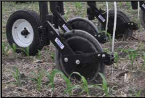
Pin Adjust Gauge Wheels