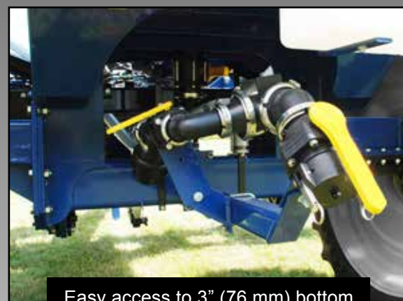
Easy access to 3" (76 mm) bottom fill plumbing

Call 800-658-3127 for Details www.BLU-JET.com